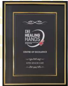
Recipient of 'Center of Excellence' award from Deccan Herald, 2021