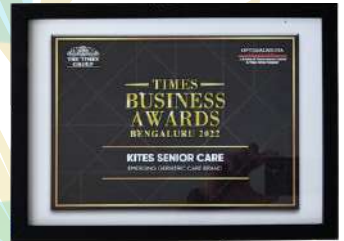
Recipient of 'Emerging Geriatric Care Brand' Times Business Award, 2022