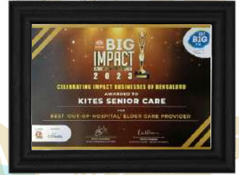
Recipient of 'Best 'Out of hospital' elder care provider' Big Impact Award, 2023